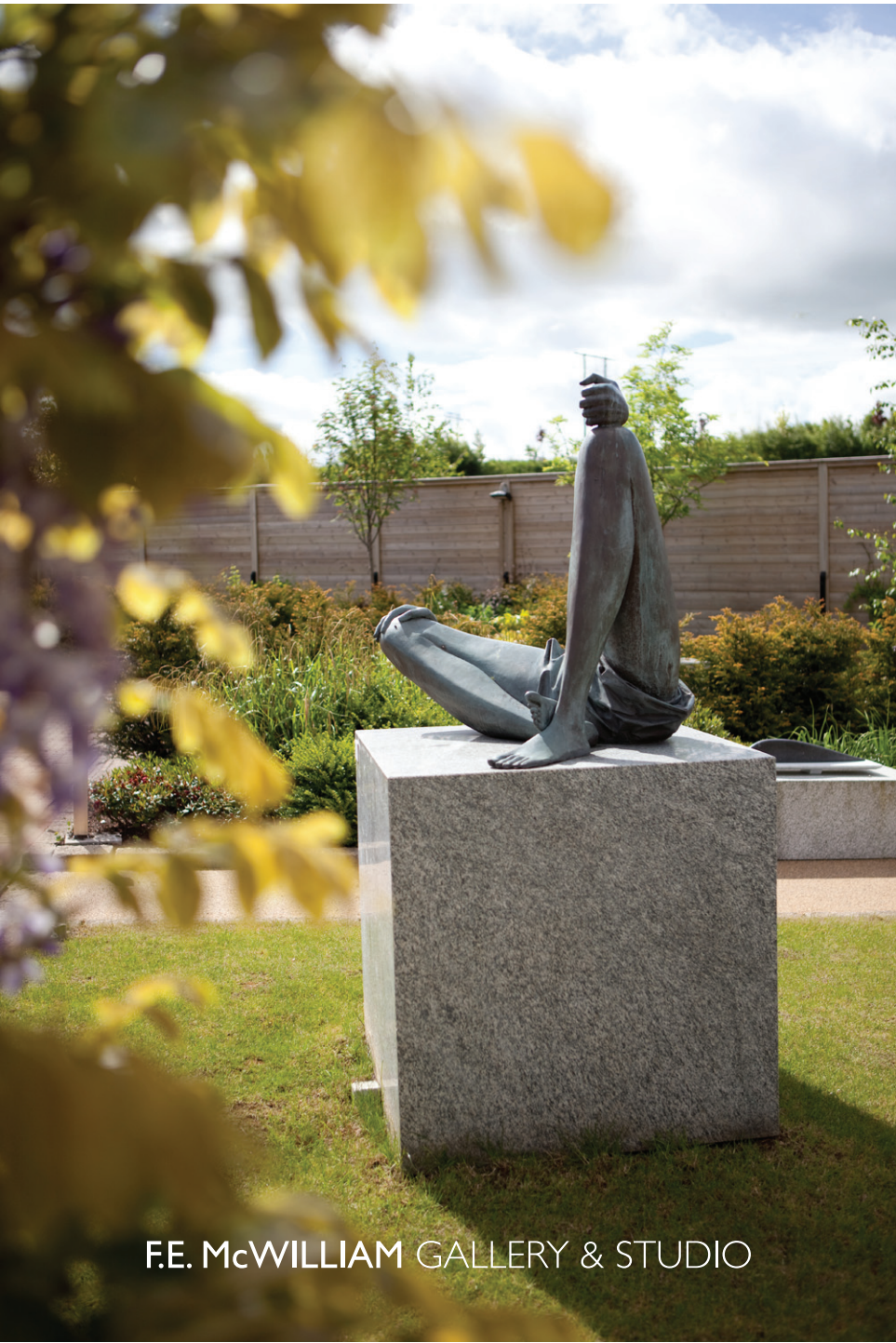
F.E. McWILLIAM GALLERY & STUDIO